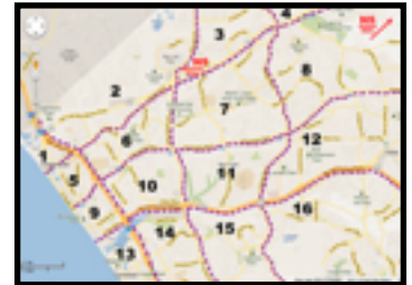
Oceanside, CA in 16 Zones

While planting these churches, we will be creating a leadership laboratory , where people from all over the world can come and get hands-on experience planting churches.